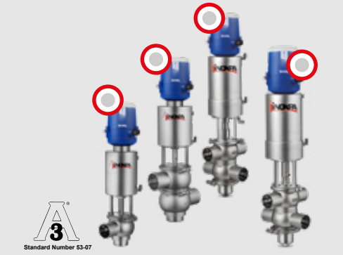
Single and double seat valves