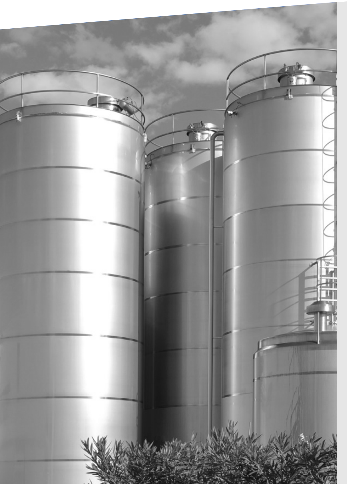
Back to index