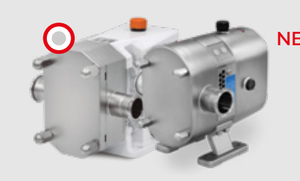
Rotary lobe pumps: SLR, Ultilobe